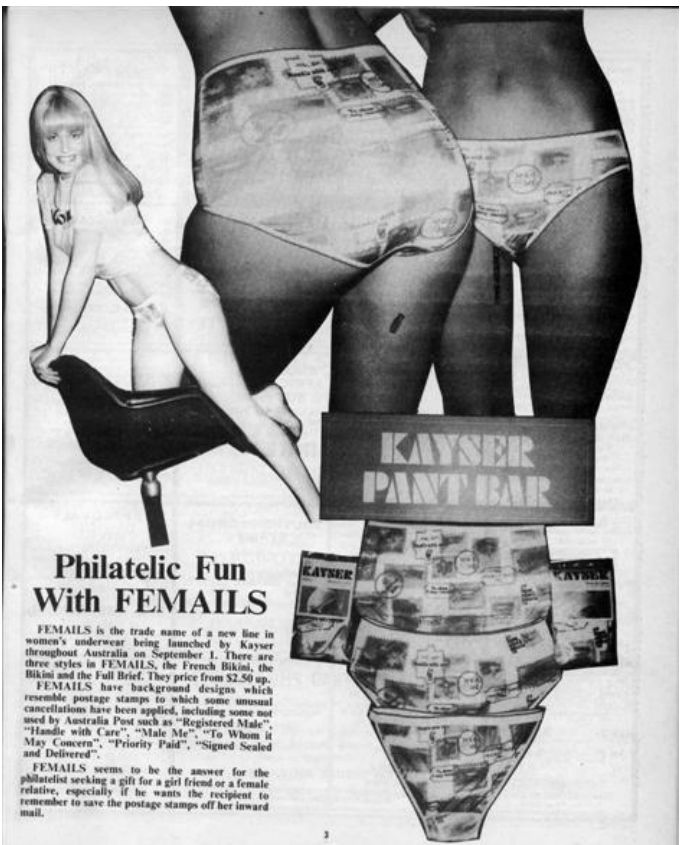
From Australian Stamp News (a long time ago)!

In fact, it does seem that postage stamps (in the United States and Germany, at least) do remain the property of the government both before and after use/cancellation and are classified as "obligations of the state" — ie. they are receipts for government service owed or rendered.